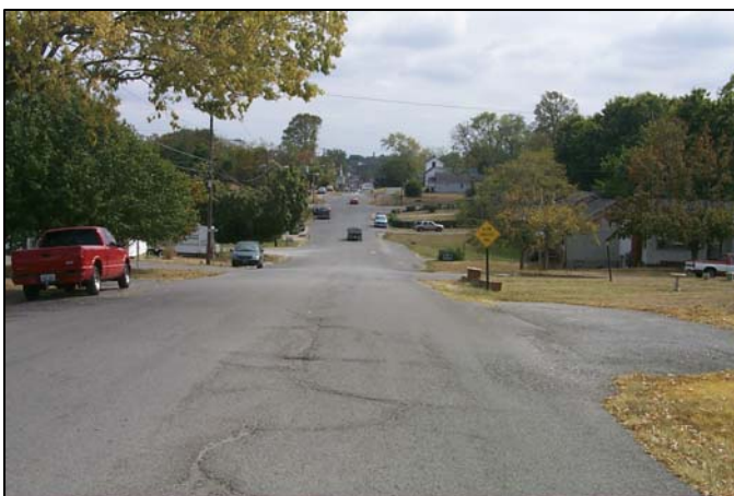
Photo 23 Broadway looking east from West Lane