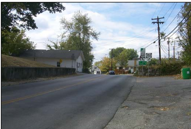
Photo 15 Intersection of US 68 and KY 152, looking west