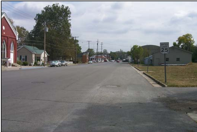
Photo 21 Broadway Avenue looking east from Hill Street