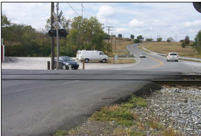
Photo 14 Cornishville Road Railroad Crossing looking west on Cornishville Road