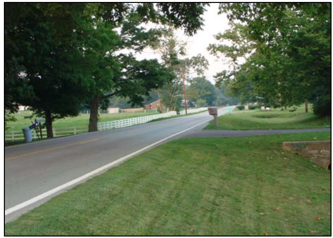
Photo 20 KY 152 Looking East