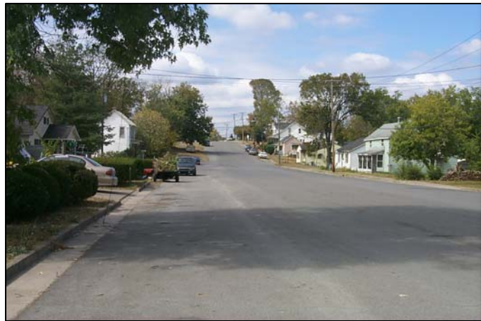
Photo 22 Broadway Avenue looking west from Hill Street