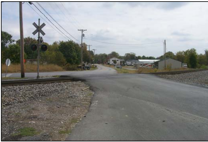
Photo 12 Cornishville Road Railroad Crossing looking east on Cornishville Road