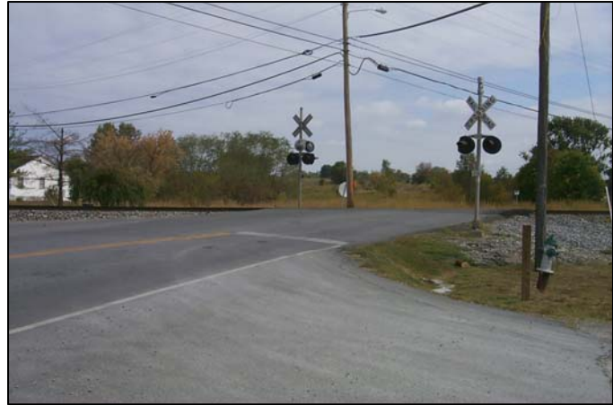
Photo 13 Cornishville Road Railroad Crossing looking northeast towards Moberly Road