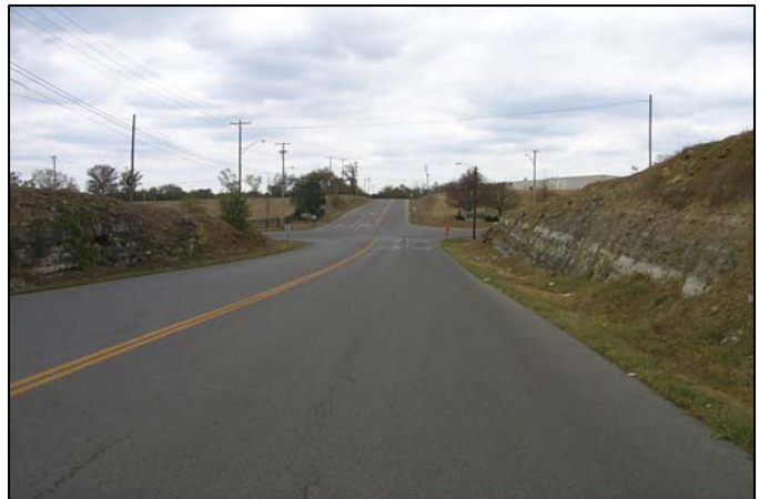
Photo 10 Corner of Moberly Road and Tapp Road looking west from Tapp Road

Corner of Moberly Road and Tapp Road looking south from Moberly Road