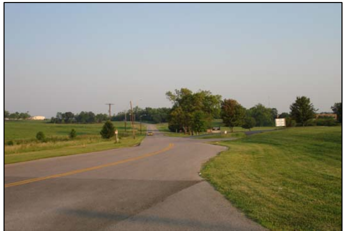
Photo 6 Industrial Drive, looking south

Industrial Drive, looking west at Wausau Paper